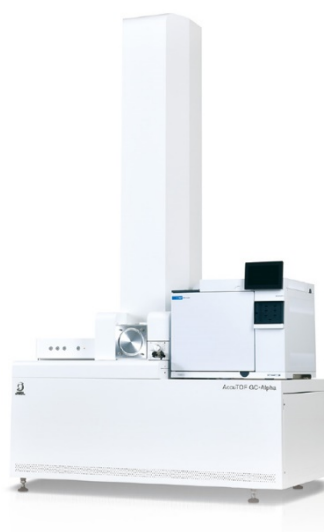
Fig. 1 JEOL GC-HRTOFMS systems: JMS-T2000GC

Recently, JEOL announced the release of the JMS-T2000GC “AccuTOF™ GC-Alpha”, which is the 6th generation GC-HRTOFMS in the JEOL “AccuTOF™ GC” series (Fig. 1). The GC-Alpha achieves three times higher mass resolving power (10,000→30,000 @ m/z 614) and three times higher mass accuracy (3ppm→1ppm, EI standard ion source) than the previous model. In this work, we used direct probe field desorption (FD) of crude oil (a very complex mixture) to monitor the effects of improved resolution. Additionally, the JEOL msRepeatFinder software was used to examine the crude oil data by using Kendrick mass defect (KMD) plots in order to more clearly visualize the effects of improved mass resolution on the analysis results.